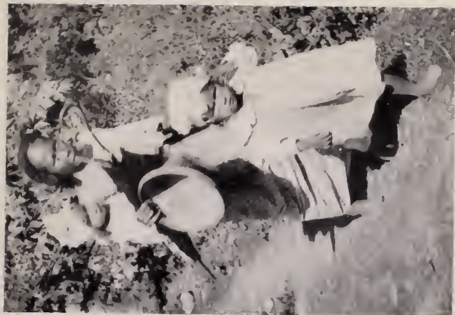
A Filipino woman going to market